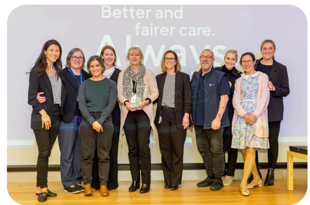
CEO Award: Surgery Team - Hitting Triple Zero