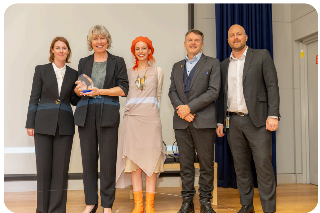
Patient Experience Award: Arts Health Program