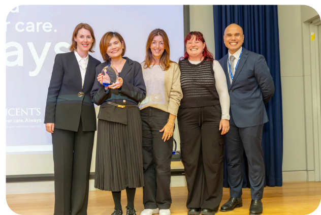
People and Culture Award: Drug & Alcohol Admin Team