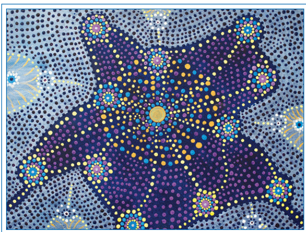
Dalarinji; Ours belonging to us

St Vincent's Hospital Sydney acknowledges Aboriginal and Torres Strait Islander peoples as the Traditional Custodians of the lands and water where we live and work. We respect their spiritual connections to country and community and pay our respects to their Elders past, present and emerging. We commit ourselves to the ongoing journey of Reconciliation.